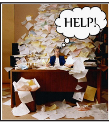
Reduce the paperwork coming into your home !

E-Statements are convenient and secure. Make the switch today and take advantage of the following benefits: